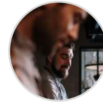
PASSIONATE EMPLOYEES RESPECTFUL OF THEIR LAND