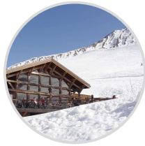
18 MOUNTAIN RESTAURANTS