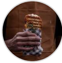
AN OFFER FOR ALL TASTES